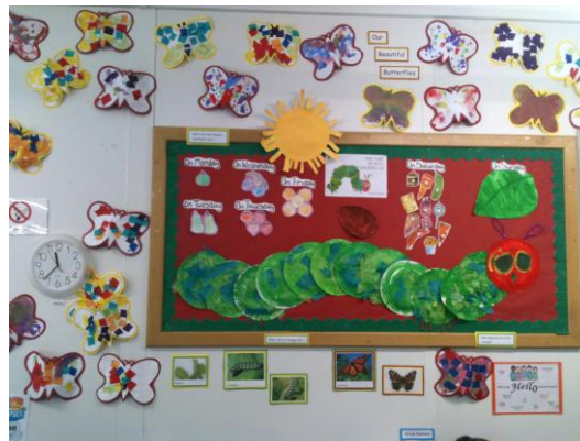
Our Hungry Caterpillar Display