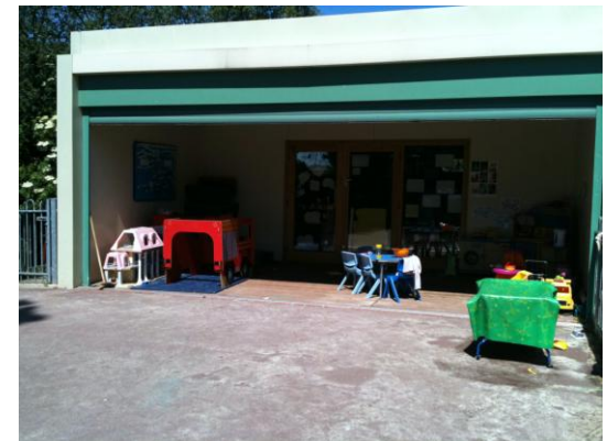
Outside Play Area